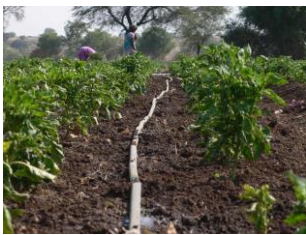
Farming and Agriculture