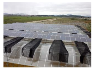
Industrial Pump Applications